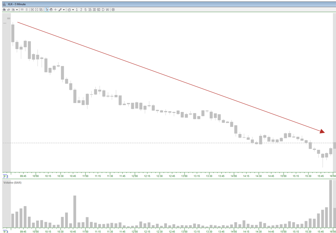
Price move on 09/03/2024 for sector: XLK